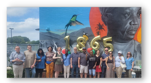
To keep staffing lean, Nuestra relies on longtime partners WinnCo Residential and Opportunity Communities for property management, resident services, and administration.