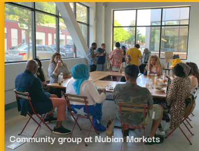
Community group at Nubian Markets