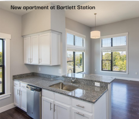
New apartment at Bartlett Station